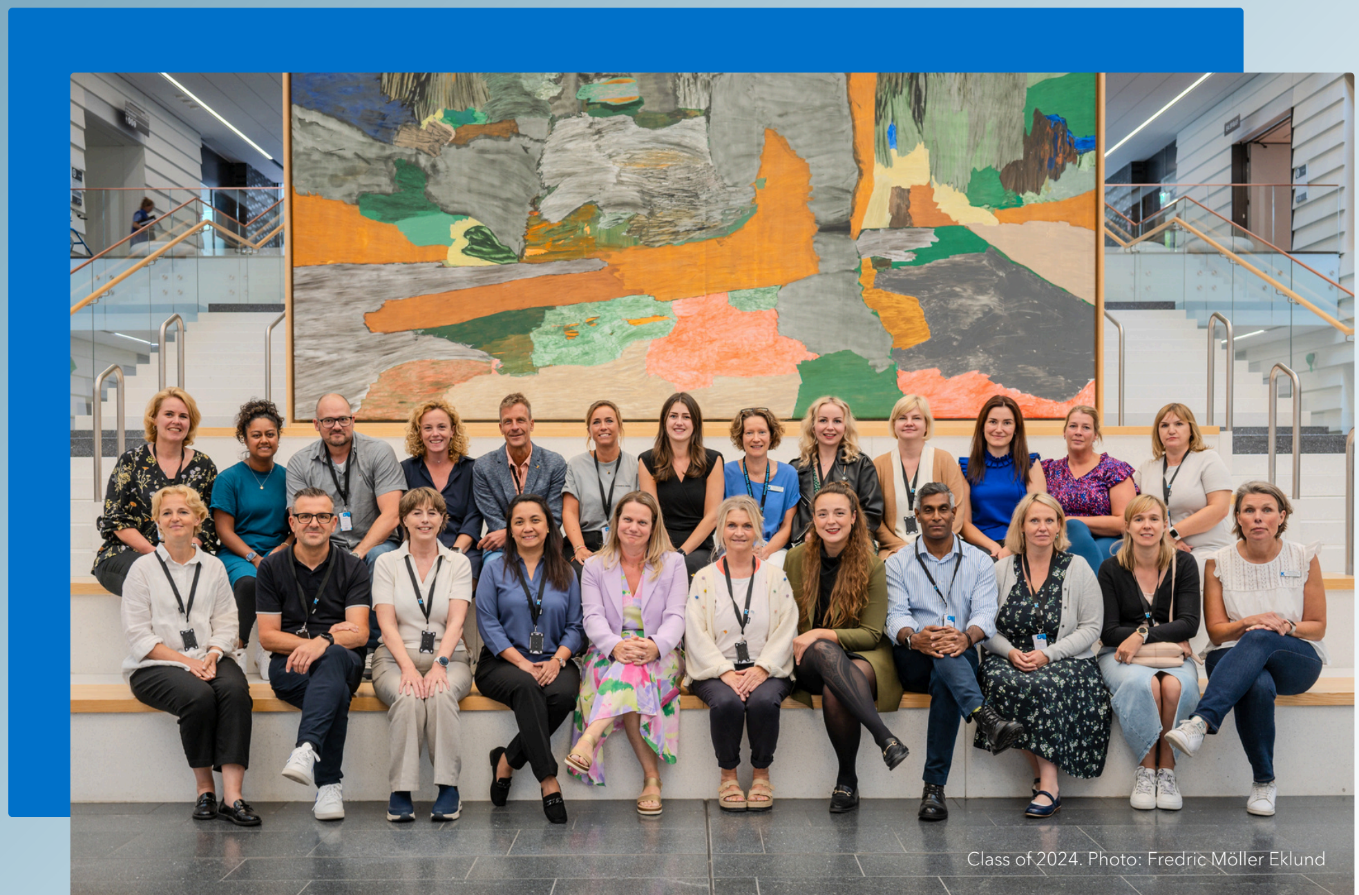
Class of 2024.

The integration of artificial intelligence is also a key element, advancing cancer therapies and improving diagnostics by analyzing vast amounts of patient data quickly and accurately.